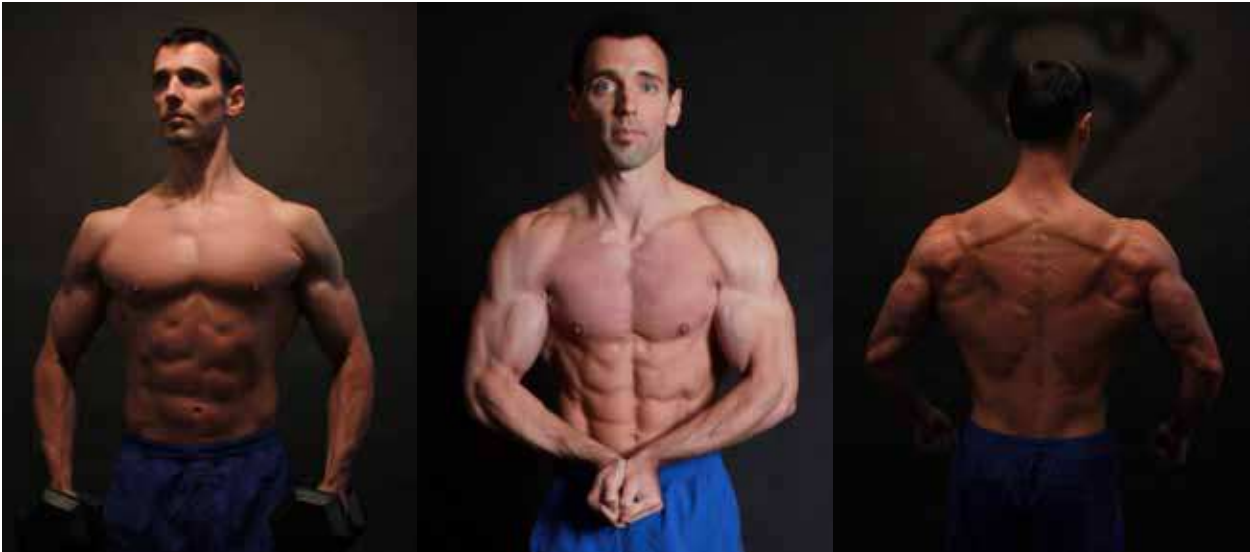
BEFORE BACK AFTER BACK